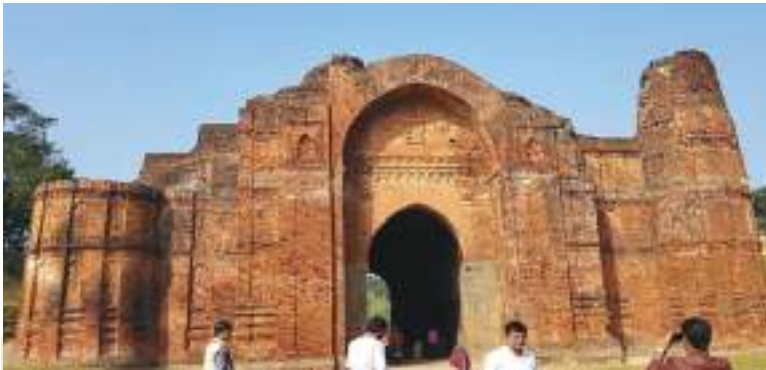
A short tour to Malda city was conducted to study and document a Report on Bengal Architecture. A good practical knowledge of the local Bengal architecture was perceived by the students with a good explanation