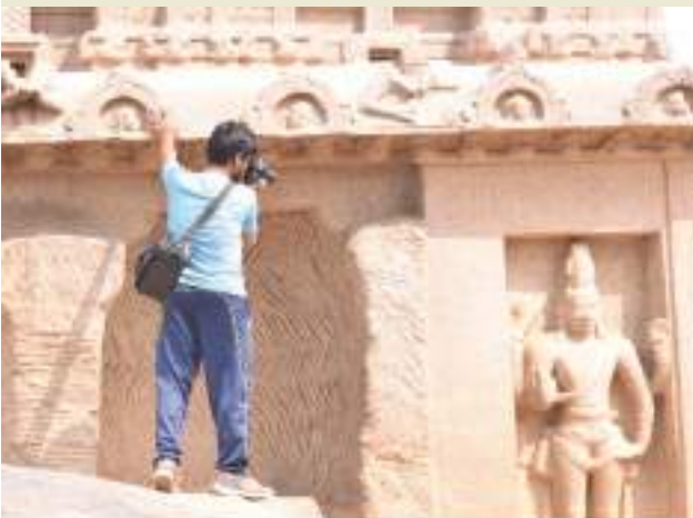
An yearly visit to various cities helps the students in their exposure to various architectural styles and construction techniques

Architecture is the thoughtful making of space.