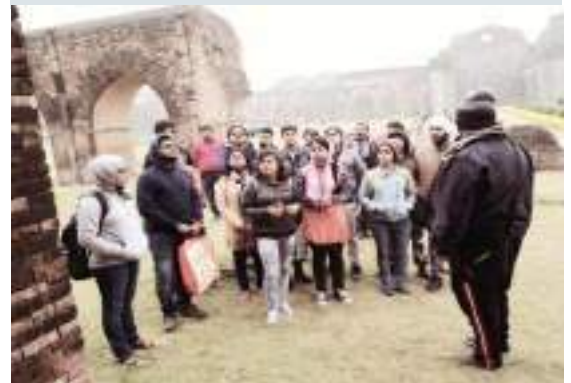
Students and teachers at the site of Adina mosque.