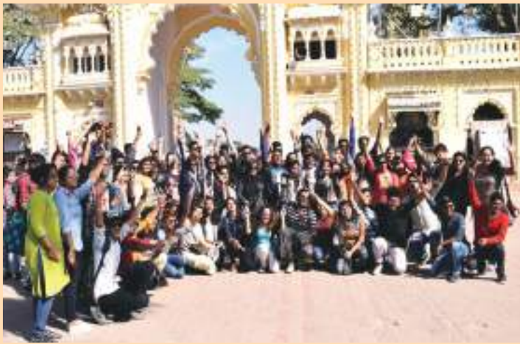
Students of OmDayal School of Architecture visited Mysore Palace and shared a group photo together.

Case study project for the 3 rd years on high-rise residential complexes were made possible at the Sunrise Park at Bangalore.